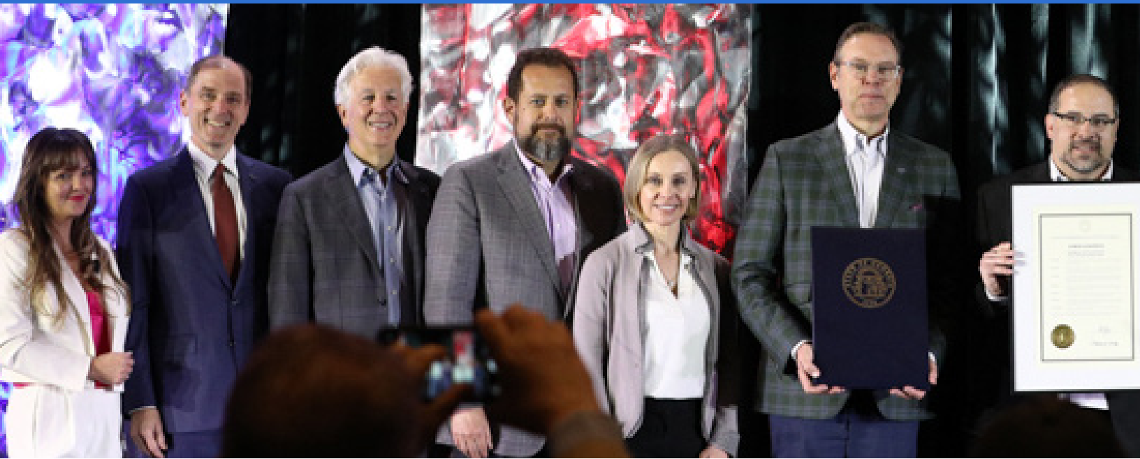
Tech Jobs Trend and Forecast